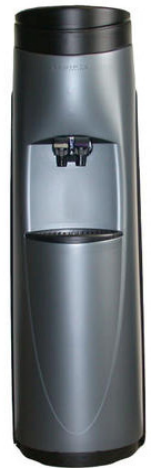
Model FC Model WC