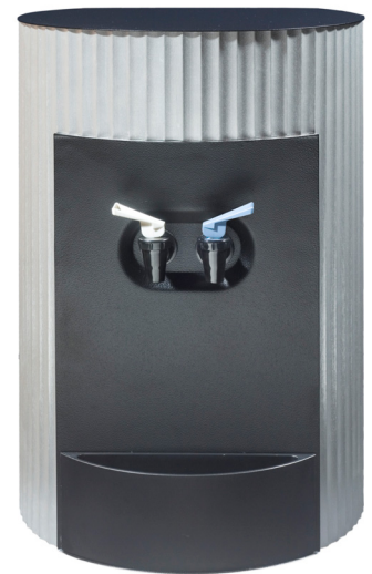
Brushed Chrome Finish Part # CT